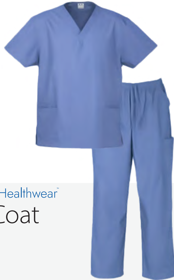
Aavvie Healthwear™ Patient Uniform