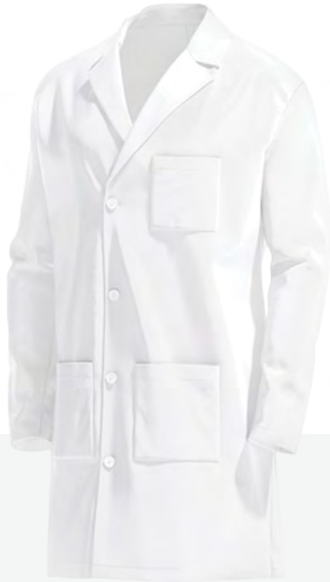
Aavvie Healthwear™ Lab Coat